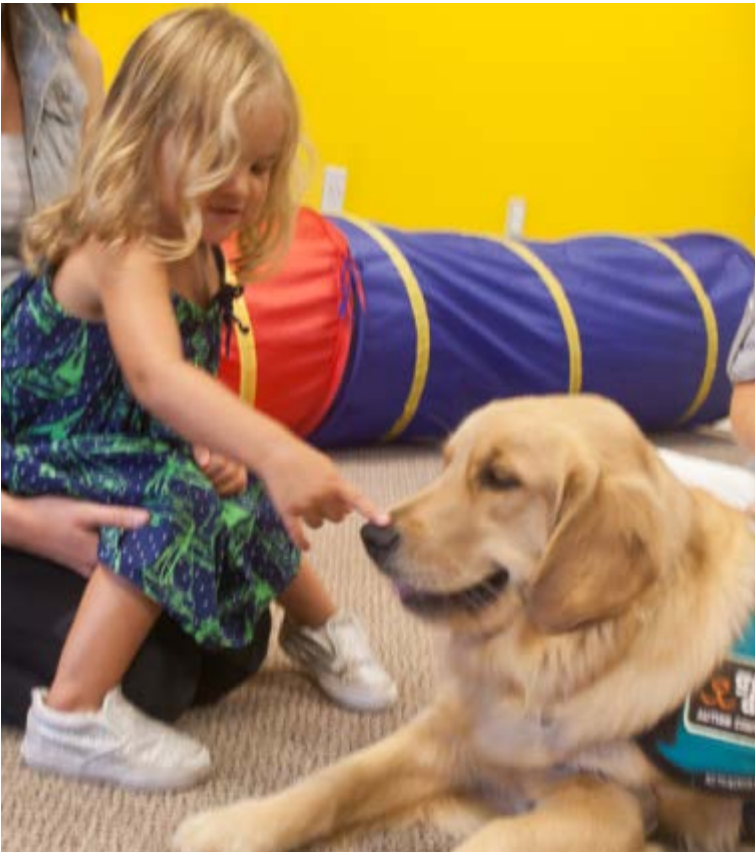
Ella with Drake